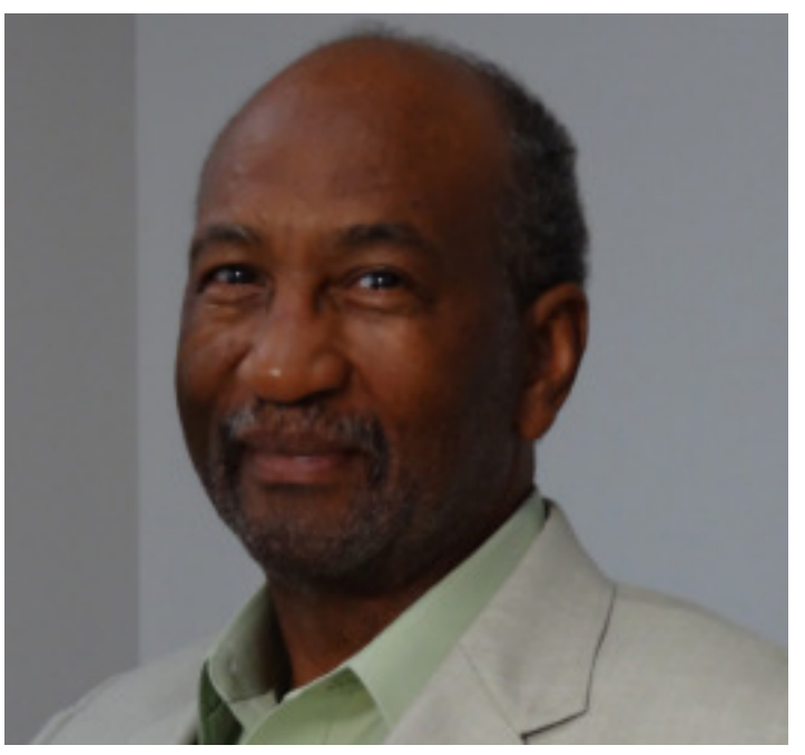
Issue 1, Sept. 2013